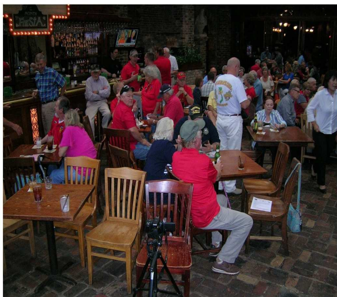
The crowd at Rosie's at Seville enjoy the sub sandwiches donated by Firehouse Subs while awaiting the start of the program.